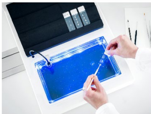
Water baths & slide warmers